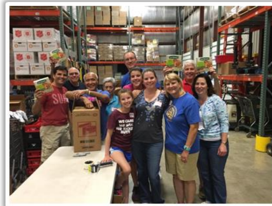
Midwest Food Bank, one of August's Service Projects