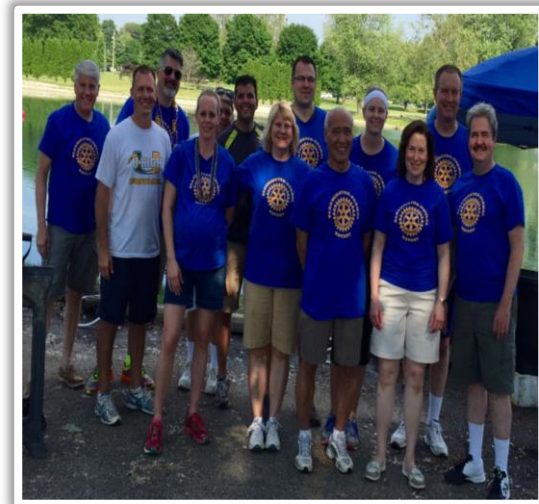
Cajun Craze 2016